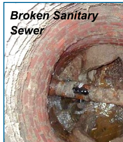
Broken Sanitary Sewer