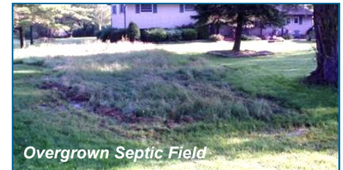
Overgrown Septic Field

Health Department and/or IDEP coordinator