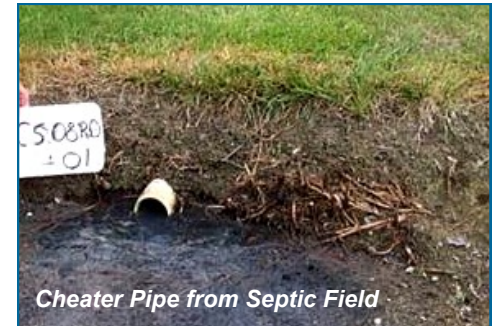
Cheater Pipe from Septic Field